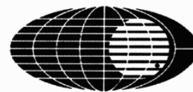
DIAGRAM NO. 1 Date February 1999